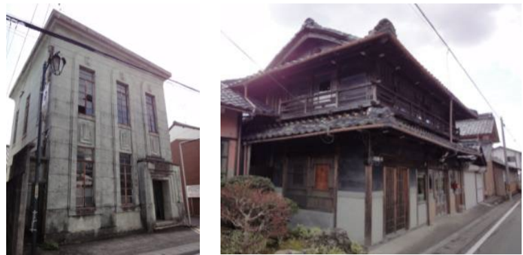
Fig.2 Historic architecture