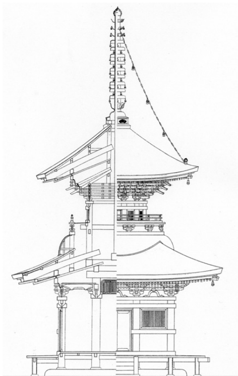
Fig.1 Drawing of pagoda (restoration)

Proposal of Reuse and Renovation Program