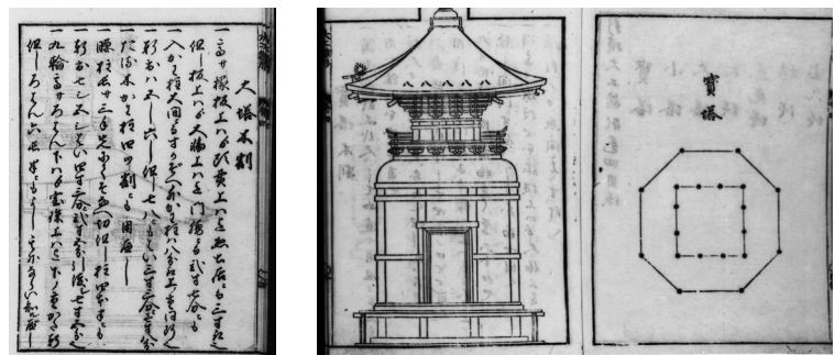
Fig.3 Historical Documents about Architecture