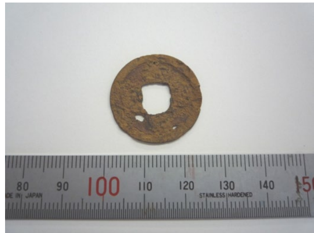
↑Copper coin①(fake coin: 皇宋通宝 <kousoutuuhou>) ↑Copper coin②(fake coin: 嘉祐通宝 <kayuutuuhou>)