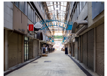
Fig.3 the textile wholesale district in front of Gifu station in Gifu city