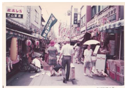
Figure2 Demachi-Masugata shopping-street in 1970s in Kyoto city “private collection”