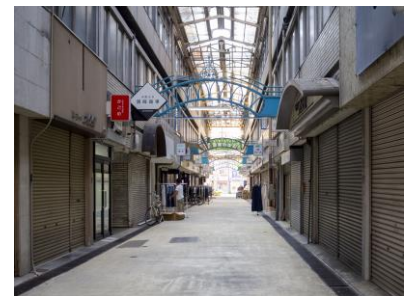
Figure3 the textile wholesale district in front of Gifu station in Gifu city