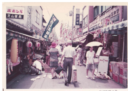
Fig.2 Demachi-Masugata shopping-street in 1970s in Kyoto city